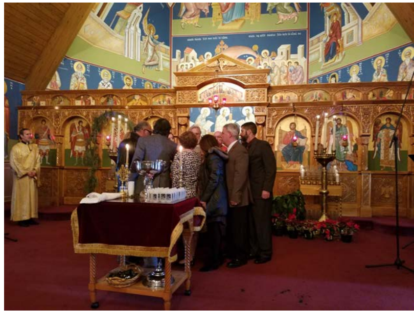
Swearing in of Parish Council, January 7, 2018