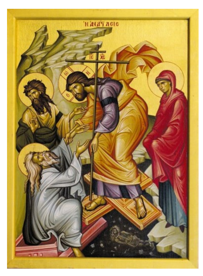
Great And Holy Pascha April 16