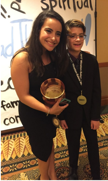
Spirit Cup Winners: