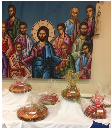
Close-up of only a handful of the beautiful Vasilopitas up for Auction.

We thank everyone who participated in our annual vasilopita fundraisers - the bakers as well as the donors! All funds to benefit St Basil's Academy and our own St Nicholas Benevolent fund.